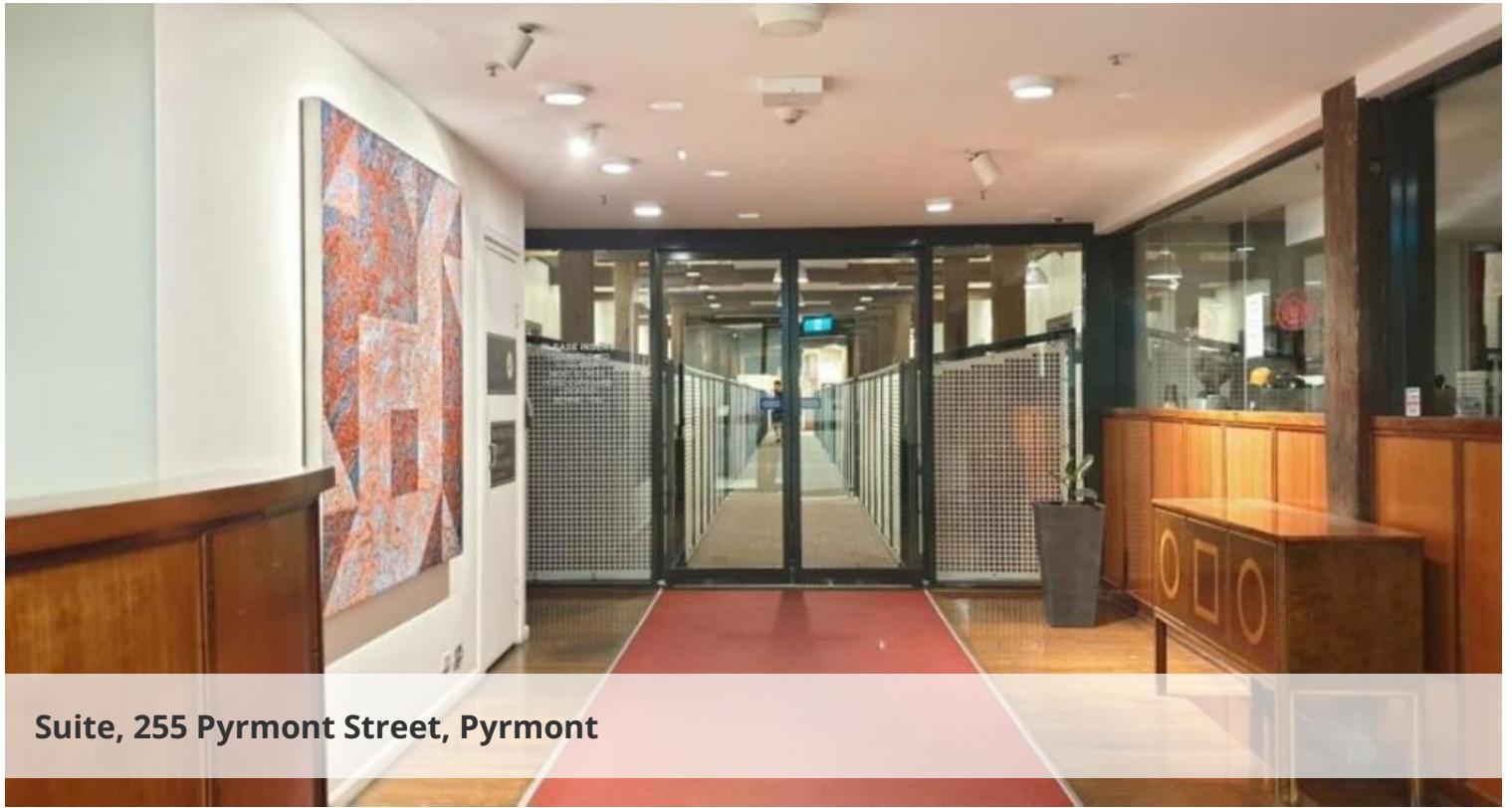
Suite, 255 Pyrmont Street, Pyrmont